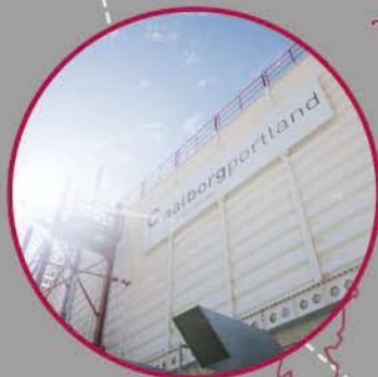
Terminal & Warehousing