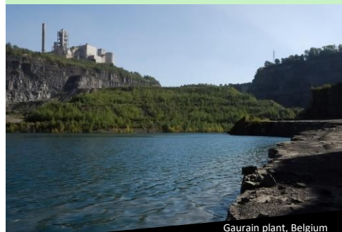
Gaurain plant, Belgium