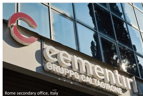
Rome secondary office, Italy

Cementir pursues a strategy aimed at strengthening its leadership in white cement, offering high added-value solutions, pursuing operational excellence, product innovation and sustainability as tools to continue to grow and generate higher returns for its shareholders. Cementir targets a 30% reduction in CO2 emissions by 2030