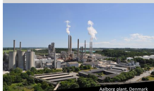
Aalborg plant, Denmark